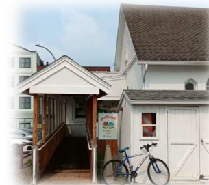
Loaves & Fishes entrance